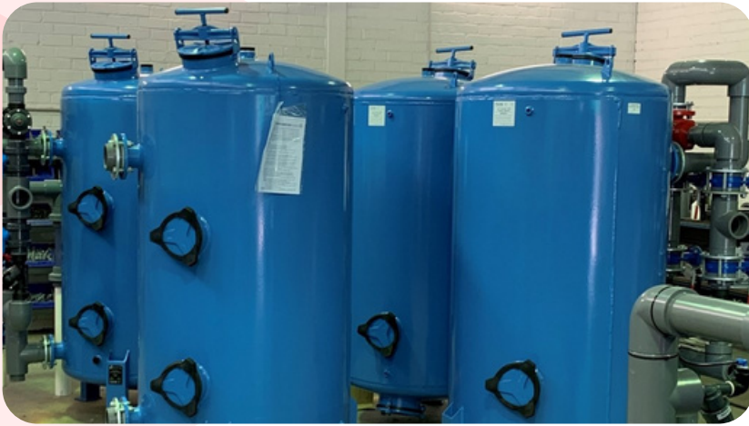
FILTRATION HOUSING MODULES